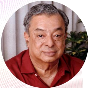
Dr Verghese Kurien

A quarterly magazine of Anandalaya, July 2018 - Sept 2018 : Issue - 5